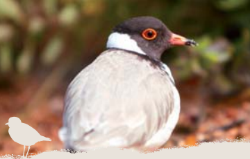
Hooded Plovers nest on the upper beach in summer. Look out for them and give them space.

NATIONAL & MARINE PARKS The Great Otway National Park covers 103,000 hectares and represents all that is special about the region: the sandy beaches, rock platforms and windswept heathland fringed by rugged coastline. Three significant Marine Parks and Sanctuaries feature along the Walk including Point Danger Marine Sanctuary, Point Addis Marine National Park and Eagle Rock Marine Sanctuary.